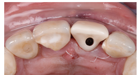
Fig. 2: Soft tissue in an immediate placement case. Courtesy of Dr. Ramón Gómez Meda. [15]

First clinical case series show that the PROGRESSIVE-LINE implant demonstrates excellent stability [14]. The tread design of the PROGRESSIVE-LINE implant makes it suitable for immediate placement and immediate loading technique (see Fig. 2 and 3; [15]). Especially the crestal anchorage thread makes it possible to place the implant with primary stability, even in patients with low residual bone height (less than 3 mm) [16].