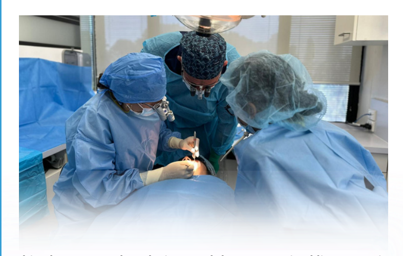
This photo was taken during Module 5 -Supervised live surgeries